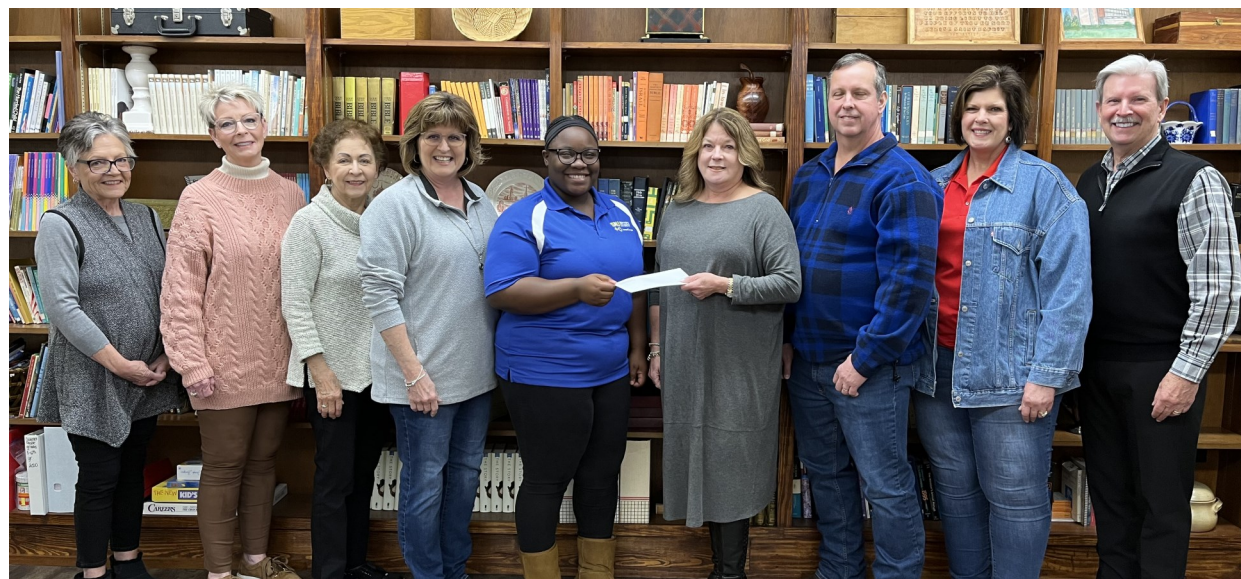
Columbia County Independent Living